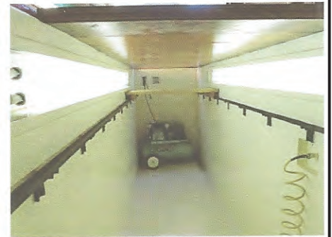
Service Pit & Compressor