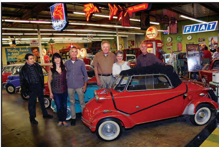
Western Region members among the Isettas.