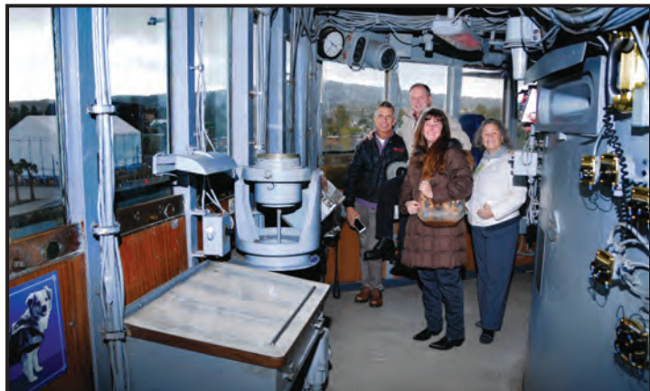
On the bridge of the USS Iowa.

Rare sunroof, Maroon with Maroon leather and fabric interior, all in beautiful condition. New correct tires. Many years in LCOC, owned since 1996 and maintained to the highest standards. Runs and drives perfect.