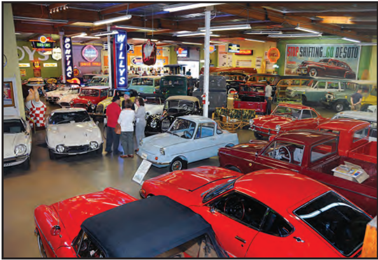
Just some of the unusual cars in the Malamut Museum.