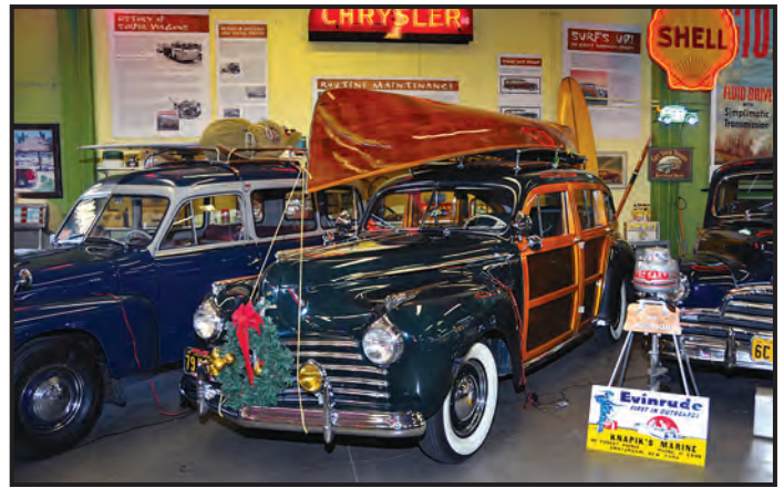
1941 Chrysler Town and Country.