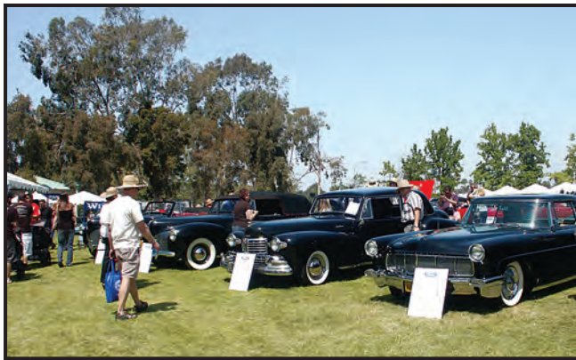
LCOC cars from last year's show.

Always the biggest turnout of any show that the LCOC Western Region participates in every year