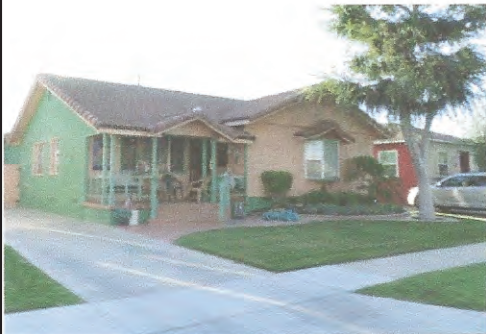
3685 Lees Avenue, Long Beach