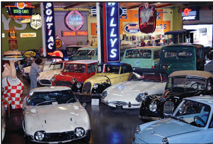
Neon signs are everywhere. Here they shine down on mini and micro import cars.