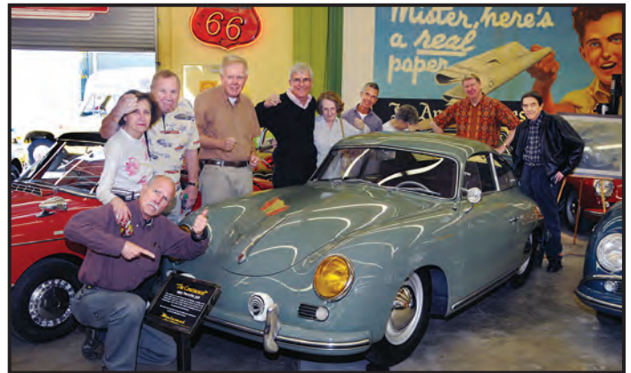
Members with a 1955 Porsche. Below, vintage VW Bus.