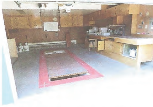
Garage with Service Pit